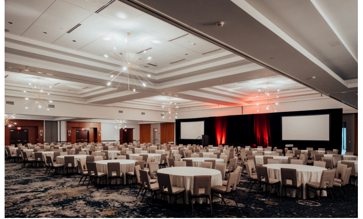
George Bellows 12,048 sq. ft

Aminah Robinson is our largest ballroom that features 15,050 sq. ft. of space. Large east-facing windows are a beautiful backdrop to any event. The room can be divided into three sections, making the space very adaptable for all events. The pre-function area can serve as a beautiful setting for cocktail hour and the ballroom can seat a maximum of 980 guests in banquet rounds.