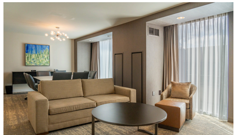
Parlor Suite 900 sq. ft.

Our King Junior Suite offers luxury accommodations with beautiful views. The suite offers 469 sq. ft. of space and includes a separate living area with a sofa bed and coffee bar.