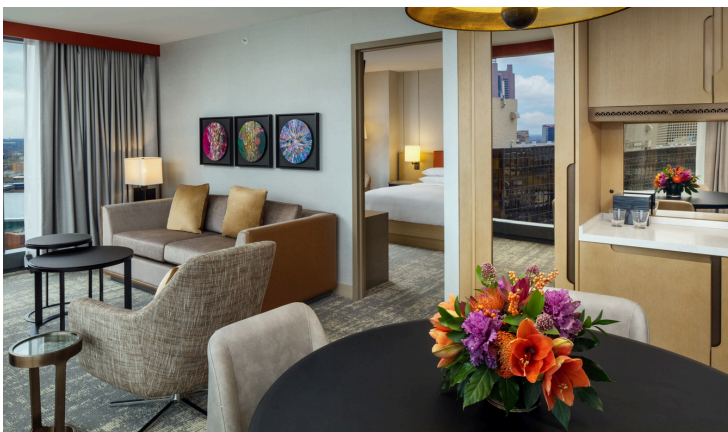
King Corner Suite 672 sq. ft.

Our spacious Parlor Suite offers 900 sq. ft. of space. The Hospitality Suite offers a wet bar, full bath and the option to connect to a Standard King or Double Queen Room.