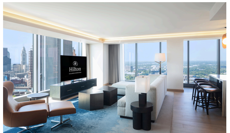
Skyline Suite 1,526 sq. ft.

Our King Corner Suite offers spacious accommodations with 672 sq. ft. of living space. The large living area has floor to ceiling windows with spectacular views of the Short North. The living room houses a dining table for 4 people as well as a wet bar. The suite offers an optional connecting Standard King Room if extra sleeping space is needed.