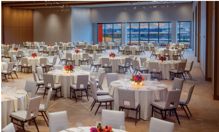
Kojo Kamau 10,500 sq. ft.

George Bellows is our second largest ballroom, featuring a little over 12,000 sq. ft of space, making it perfect for larger ceremonies and receptions. The pre-function area can serve as an ideal setting for cocktail hour.