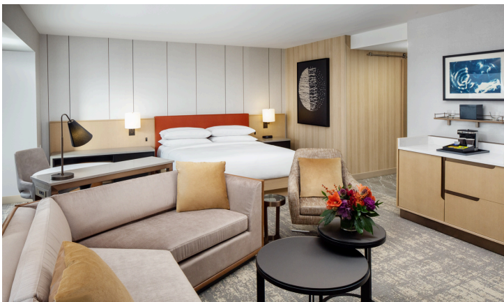
King Junior Suite 450 sq. ft.

Our King Junior Suite offers luxury accommodations with beautiful views. The suite offers 469 sq. ft. of space and includes a separate living area with a sofa bed and coffee bar.