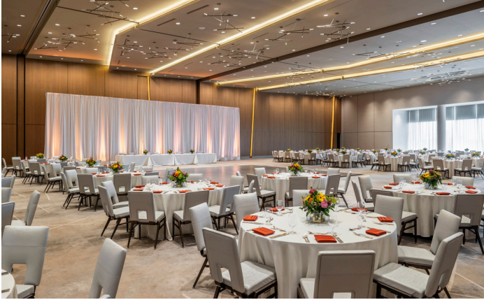
Aminah Robinson 15,050 sq. ft

Aminah Robinson is our largest ballroom that features 15,050 sq. ft. of space. Large east-facing windows are a beautiful backdrop to any event. The room can be divided into three sections, making the space very adaptable for all events. The pre-function area can serve as a beautiful setting for cocktail hour and the ballroom can seat a maximum of 980 guests in banquet rounds.