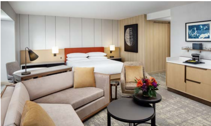
King Junior Suite 450 sq. ft.

Our King Junior Suite offers luxury accommodations with beautiful views. The suite offers 469 sq. ft. of space and includes a separate living area with a sofa bed and coffee bar.