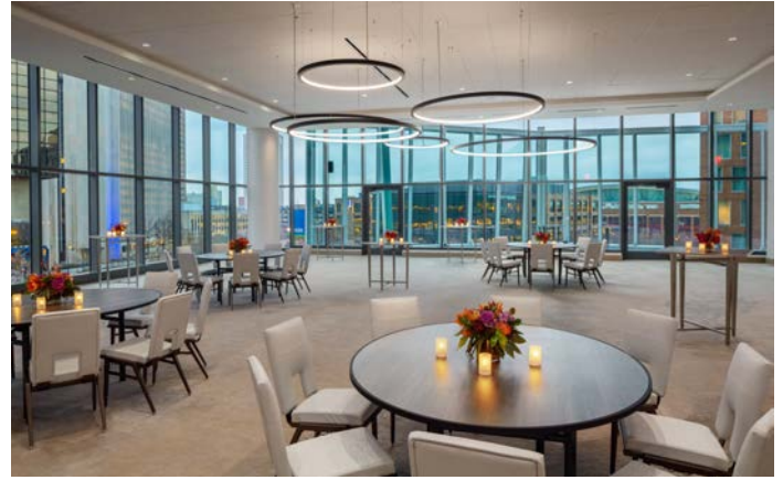
Gina Knee 3,000 sq. ft

Ema Spencer is a perfect location for an intimate event or ceremony and has 1,500 sq. ft. of space. Ema Spencer features floor to ceiling windows that add a beautiful light and airy feel to any event. This room can seat ~150 guests ceremony style.