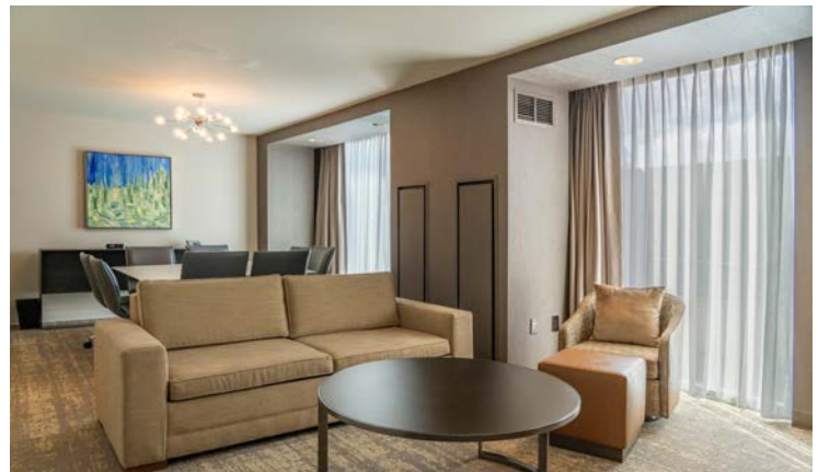
Parlor Suite 900 sq. ft.

Our King Junior Suite offers luxury accommodations with beautiful views. The suite offers 469 sq. ft. of space and includes a separate living area with a sofa bed and coffee bar.