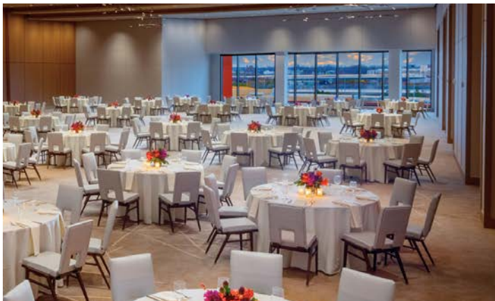
Kojo Kamau 10,500 sq. ft.

George Bellows is our second largest ballroom, featuring a little over 12,000 sq. ft of space, making it perfect for larger ceremonies and receptions. The pre-function area can serve as an ideal setting for cocktail hour.