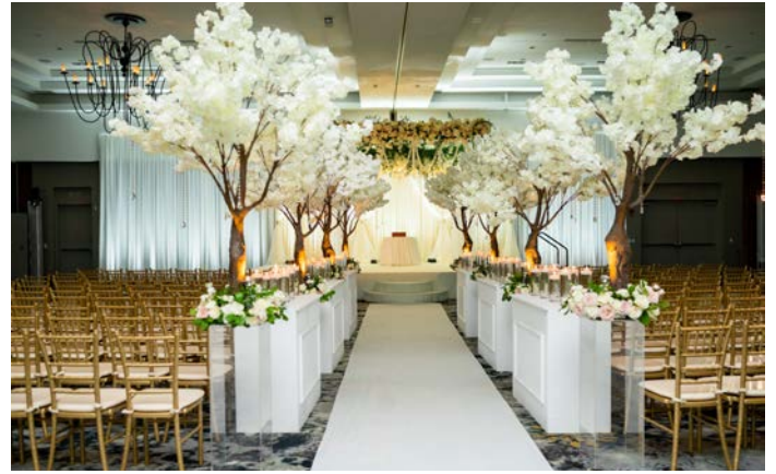
George Bellows 12,048 sq. ft

Aminah Robinson is our largest ballroom that features 15,050 sq. ft. of space. Large east-facing windows are a beautiful backdrop to any event. The room can be divided into three sections, making the space very adaptable for all events. The pre-function area can serve as a beautiful setting for cocktail hour and the ballroom can seat a maximum of 980 guests in banquet rounds.