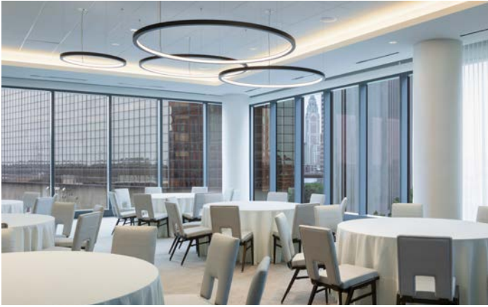
Ema Spencer 1,500 sq. ft.

Ema Spencer is a perfect location for an intimate event or ceremony and has 1,500 sq. ft. of space. Ema Spencer features floor to ceiling windows that add a beautiful light and airy feel to any event. This room can seat ~150 guests ceremony style.