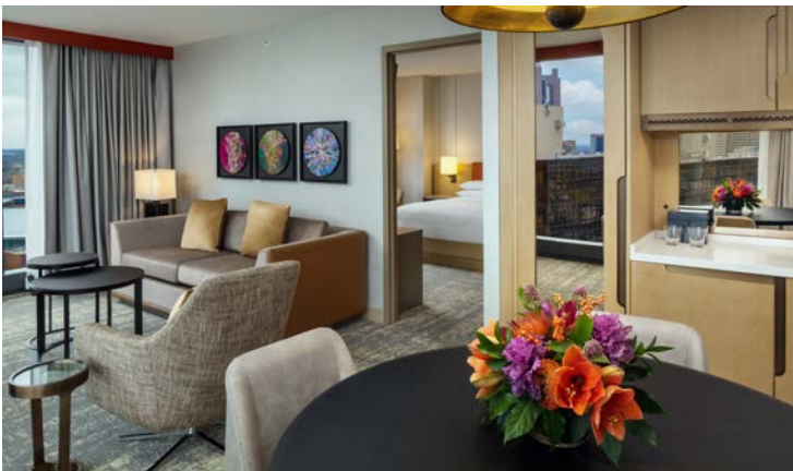
King Corner Suite 672 sq. ft.

Our spacious Parlor Suite offers 900 sq. ft. of space. The Hospitality Suite offers a wet bar, full bath and the option to connect to a Standard King or Queen Room.